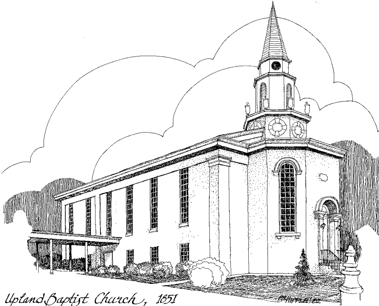
Upland Baptist Church, 1851