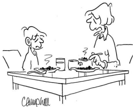
"These are vegetables, mother. You wouldn't want me to eat something I've given up for Lent, would you?"

The zoom link can be found at www.uplandbaptist.org .